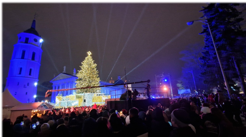
Vilnius Christmas market, December 2023