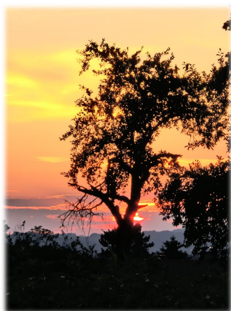
Autumn at Chiemsee, Bavaria