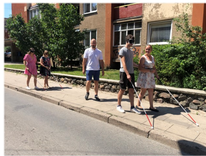
Vilnius case 2022

City activity is another part of the environment around us, so the journey continues near the busy city street – going down the hill towards the Exhibition Palace. In this section, city life reveals itself in the intensity and abundance of sounds.